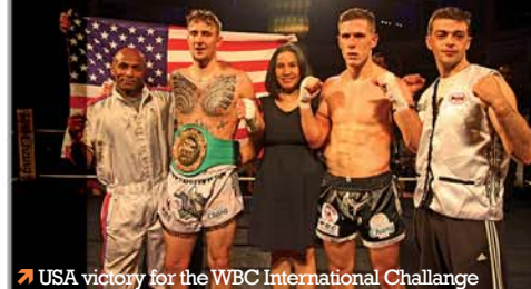
USA victory for the WBC International Challenge